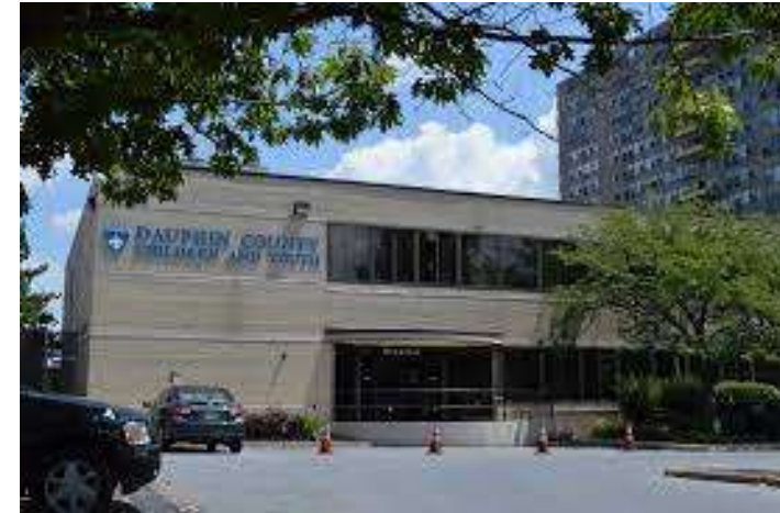
Dauphin County Children and Youth