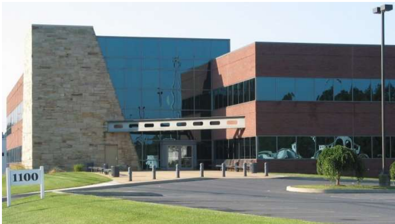
Dauphin County Department of Drug and Alcohol Services